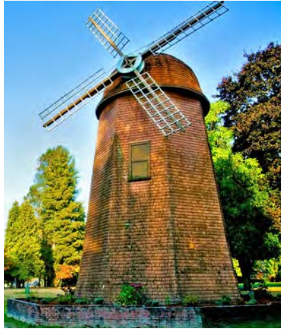
Marymoor Park, Redmond, WA

The city of Redmond is located about 15 miles east of Seattle. High-tech industry giants such as Microsoft and Nintendo of America are among the city's major employers. For outdoor fun, nearby Marymoor Park is one of Redmond's most popular places to play. This 500-acre state park has bike trails, tennis courts, soccer fields, baseball fields, a velodrome, rock climbing wall, and a famous 40-acre off-leash dog park. Redmond's weather is mild with few extremes. In the summer it remains about 80 degrees Fahrenheit, and during the winter it rarely falls below freezing. The area is known for frequent light rains, which help promote the growth and beauty of the plentiful evergreen trees.